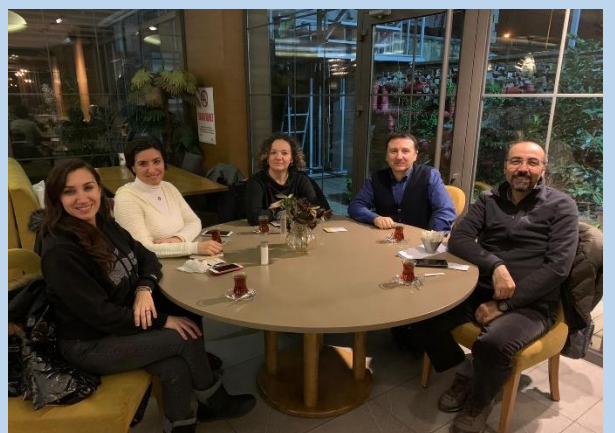
January 07, 2020 – Meeting includes the topics such as planning the activities for students