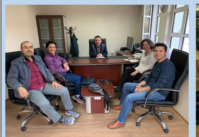
November 19, 2019 – Meeting includes the strategies student selection and motivation for the aim of the project