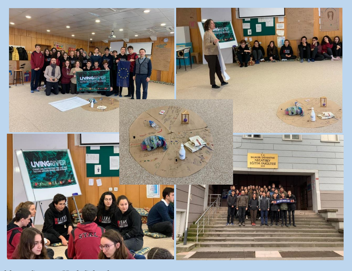
Balıkesir Science High School